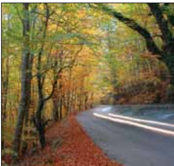
4 THE ALLEGHENY APEX

Maybe it was the lure of the Car and Driver Loop or maybe it was the time of the year or maybe it was the Glen Laurel Inn or just maybe it was a chance to meet other BMW enthusiast who like to have a good time. Whatever the reason everyone I have talked to is excited about the Grand Tour.