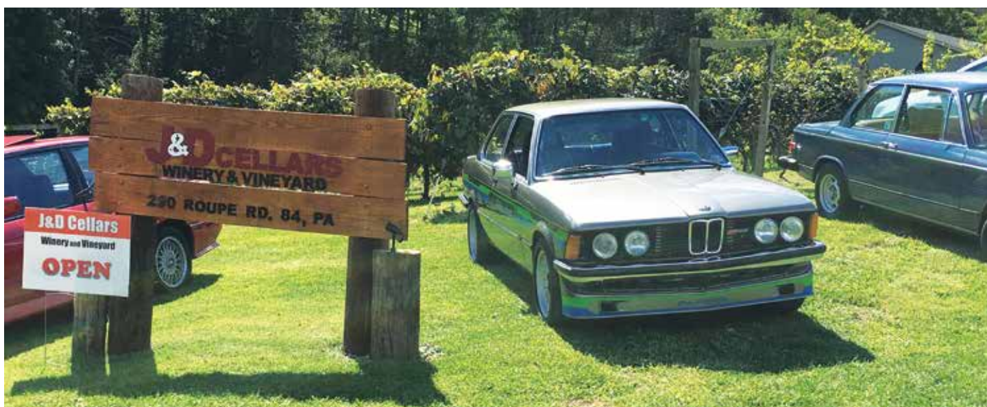
WINE DOWN: Members meet for a chapter social event at J&D Cellars in Eighty Four, Pennsylvania on September 11th, 2016.

As we come to the close of another year, I simply wanted to give thanks to the members of the Allegheny Chapter for all you do.