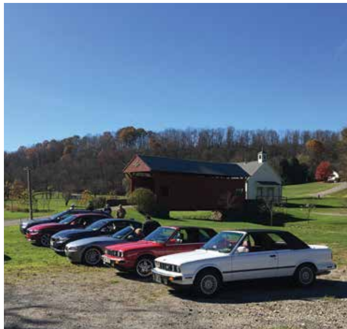
LAST BLAST: Members meet to enjoy fall colors, fun turns and warm weather during the Last Drive of 2016 in November.

A lot goes into planning a drive, including finding a destination, calculating the duration, planning where there will be bio-breaks and anticipating points of separation.